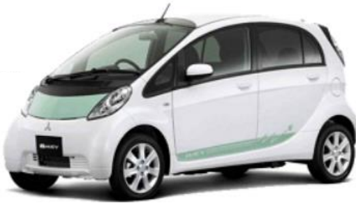
Figure 1 Hybrid Car

The latest version of the Honda model has a 20-kW lithium battery with a capacity of 100 kAh and a 17-kW electric motor. In these models you cannot talk about electric autonomy, because with the exception of some models that are capable of disconnecting the combustion engine at moderate speed, they cannot be driven by battery power.